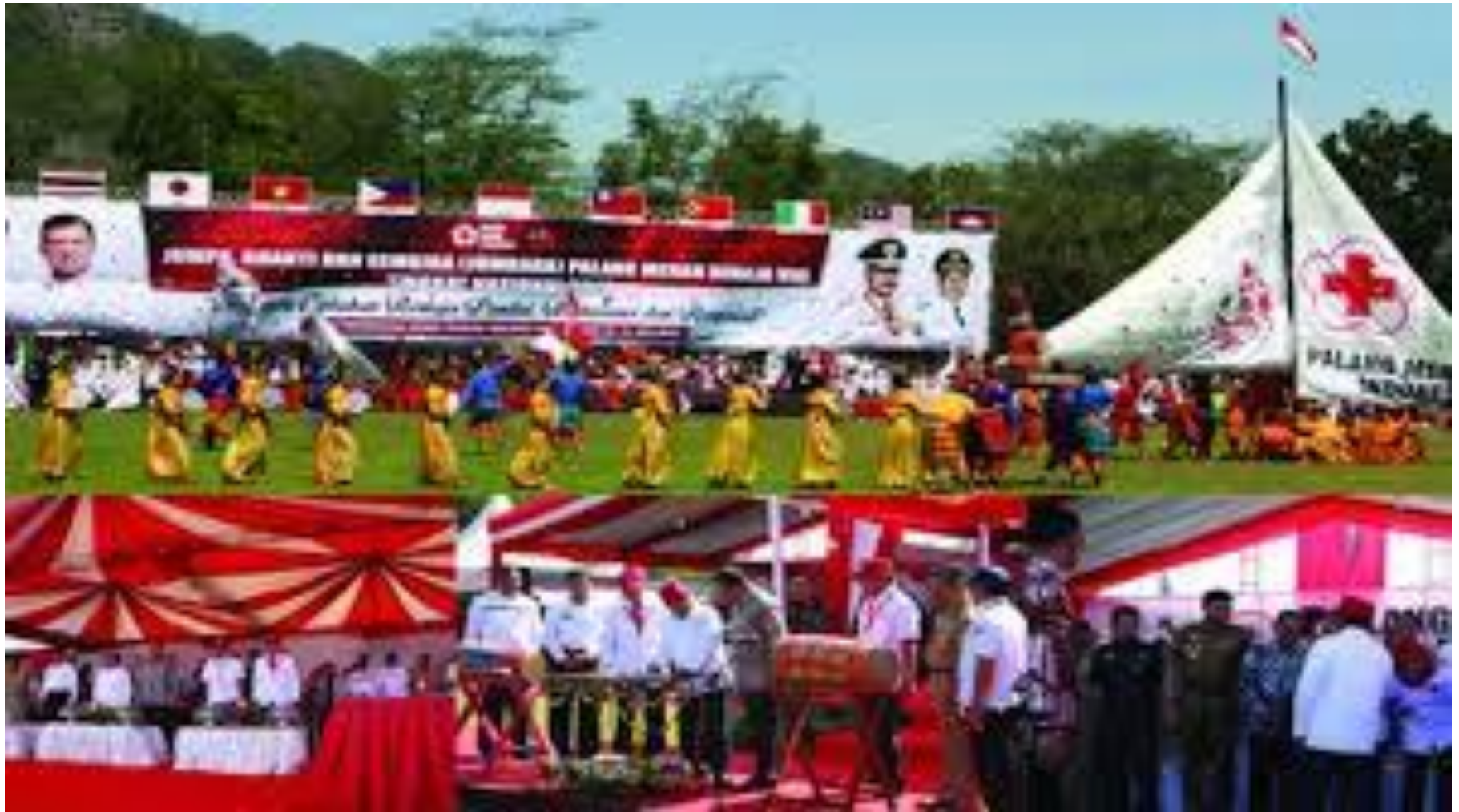
The National JUMBARA of Indonesia