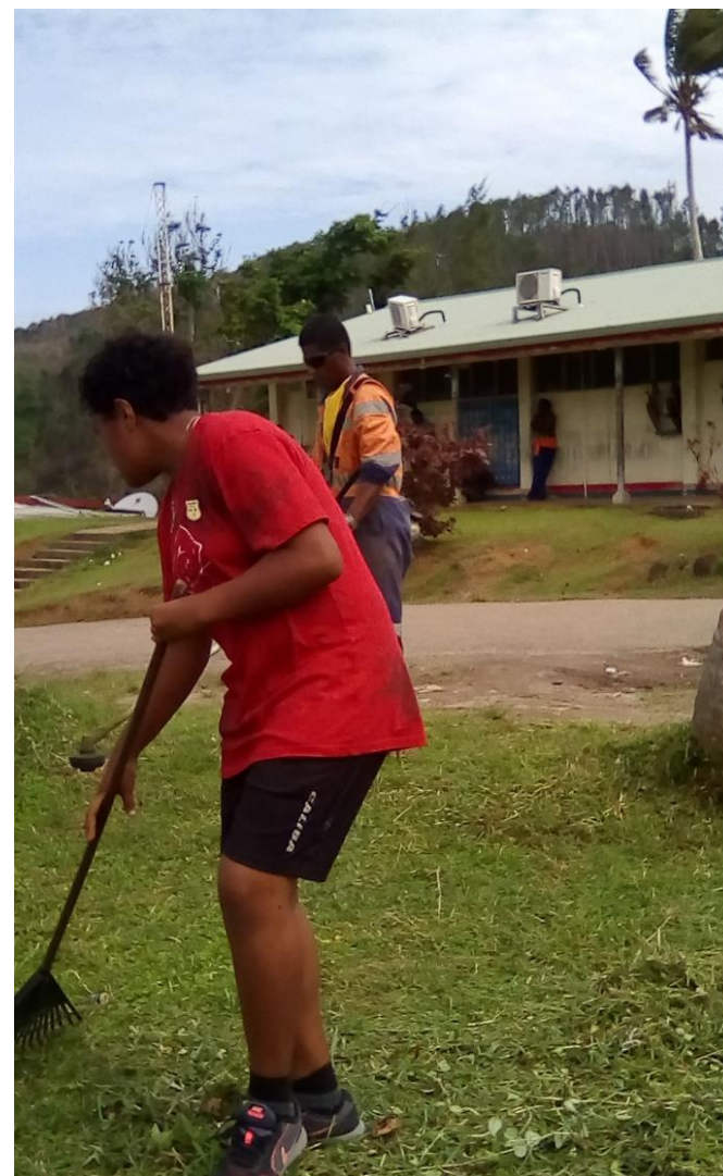
JRC Members cleaning up the Fiji Red Cross Office in Vunisea Village, Kadavu Island