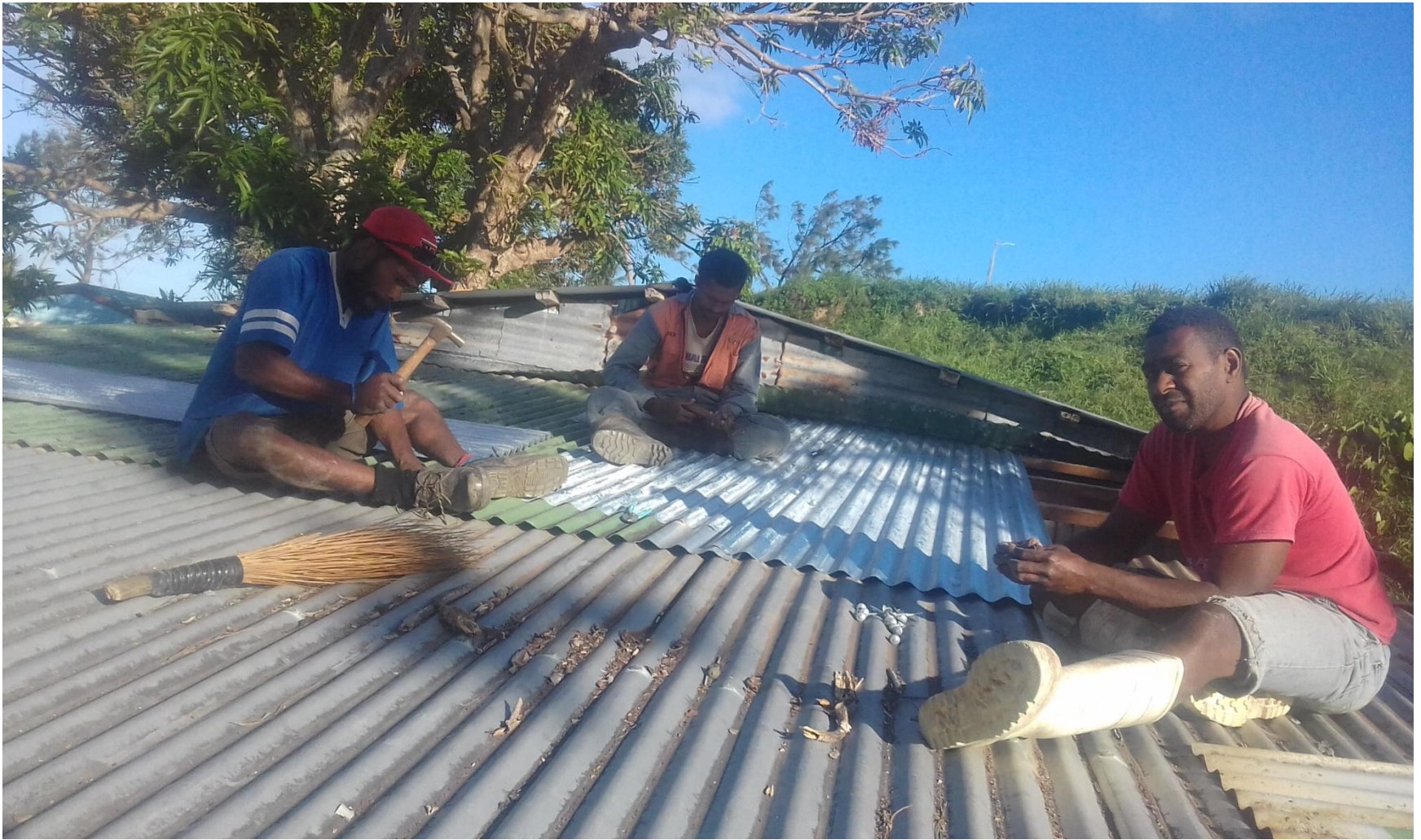
Guardians of JRC members in Kadavu repair the roof of a community house in Mokoisa Village, Kadavu Island.