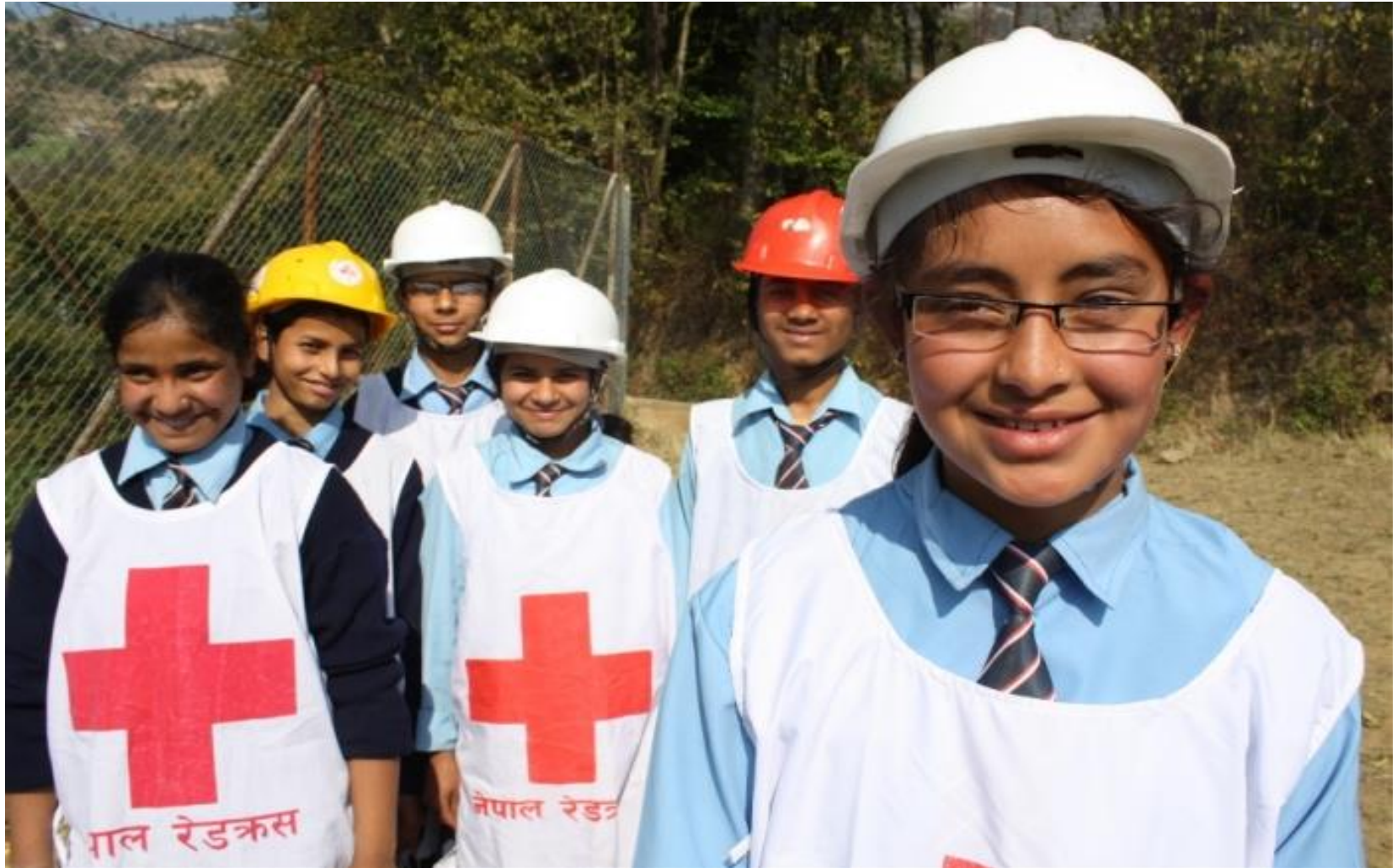
Trainings to boost the rescue capabilities in junior/youth members of Panchakanya Secondary School by Red Cross district chapter, Bhaktapur.