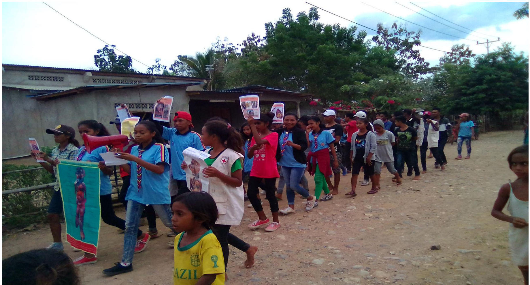
Red Cross volunteers and Timor Leste Scouts did the campaign about cigarettes together in halecou, Timor-Leste.