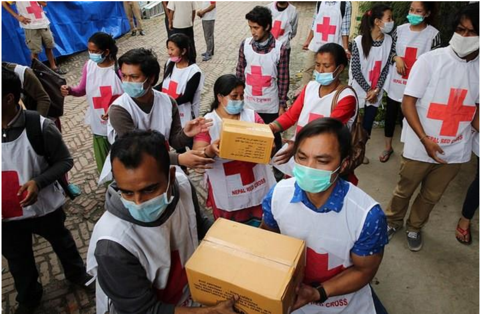
Youth members of Nepal Red Cross collecting aids with purpose of helping the victims of massive earthquake 2015 April 25.