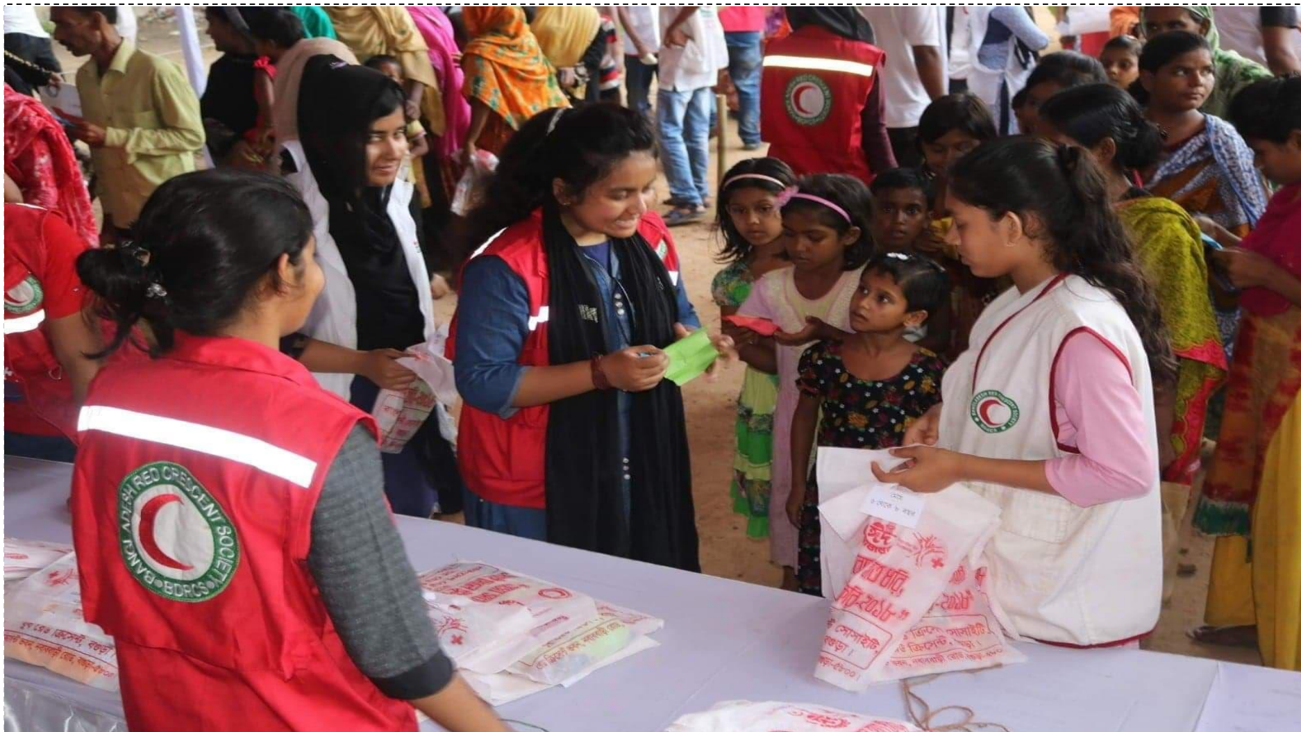
In picture, BDRCS RCY Volunteers are distributing new clothes to the underprivileged children as a gift of Eid Festival.