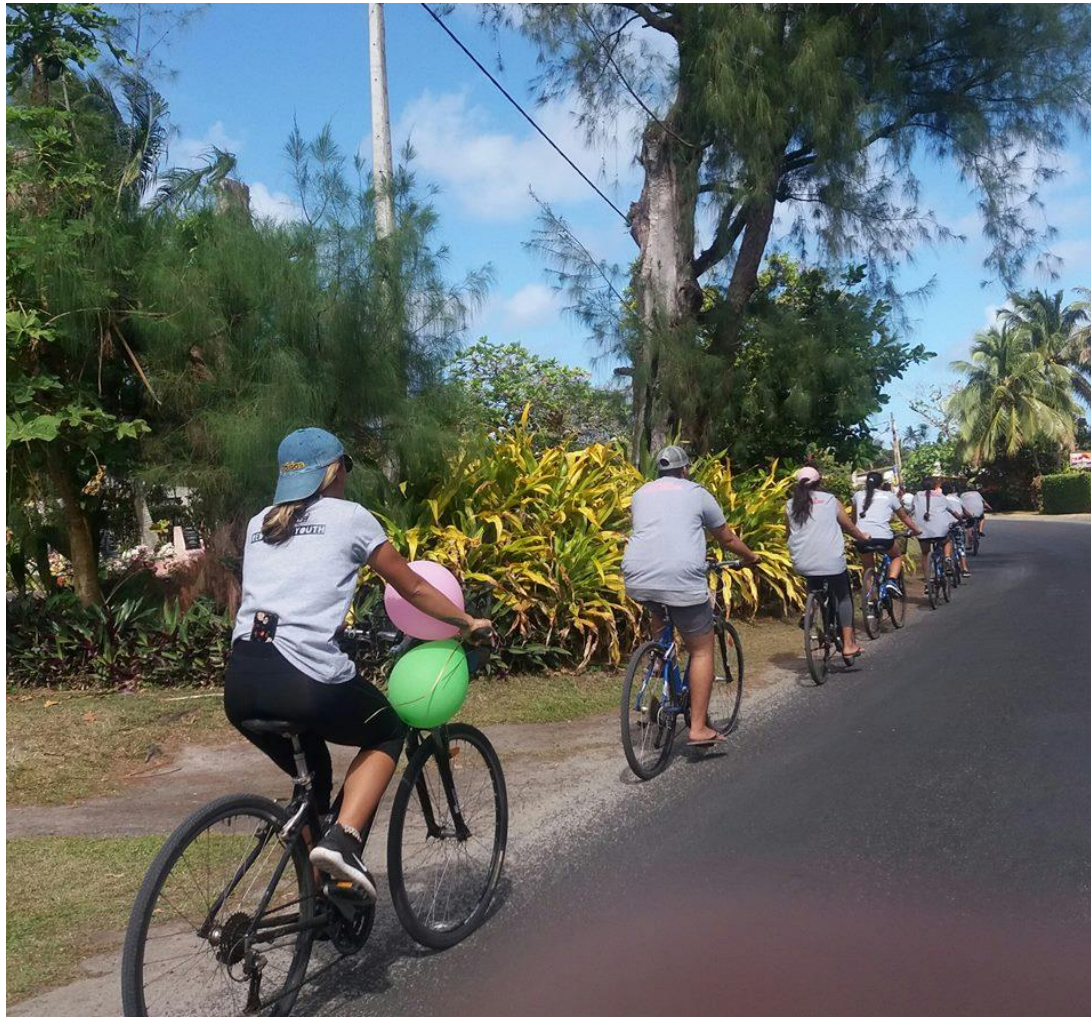
Red Cross Youth Cycling around Rarotonga