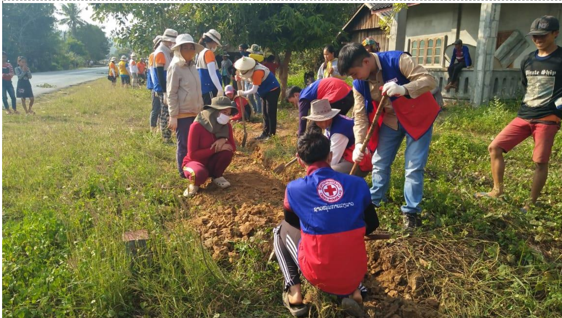
Lao and Korean Red Cross Youths co-work to install the water pipe during the exchange programme in Laos to support the life condition of vulnerable people in rural area