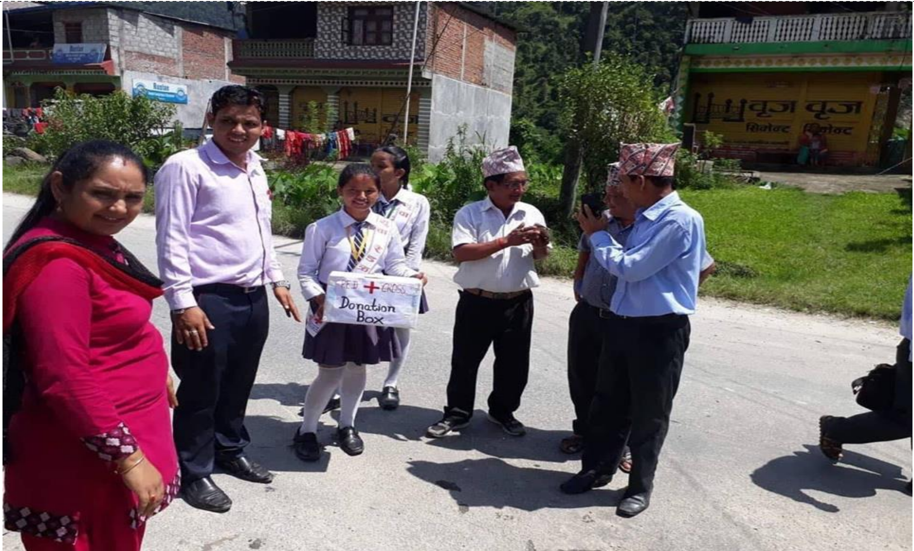
JRC members collecting donations for flood victims