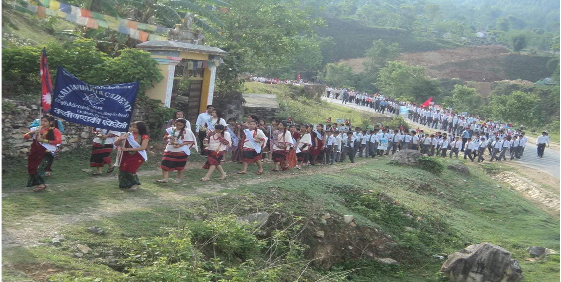
Rally was conducted during world Environment day