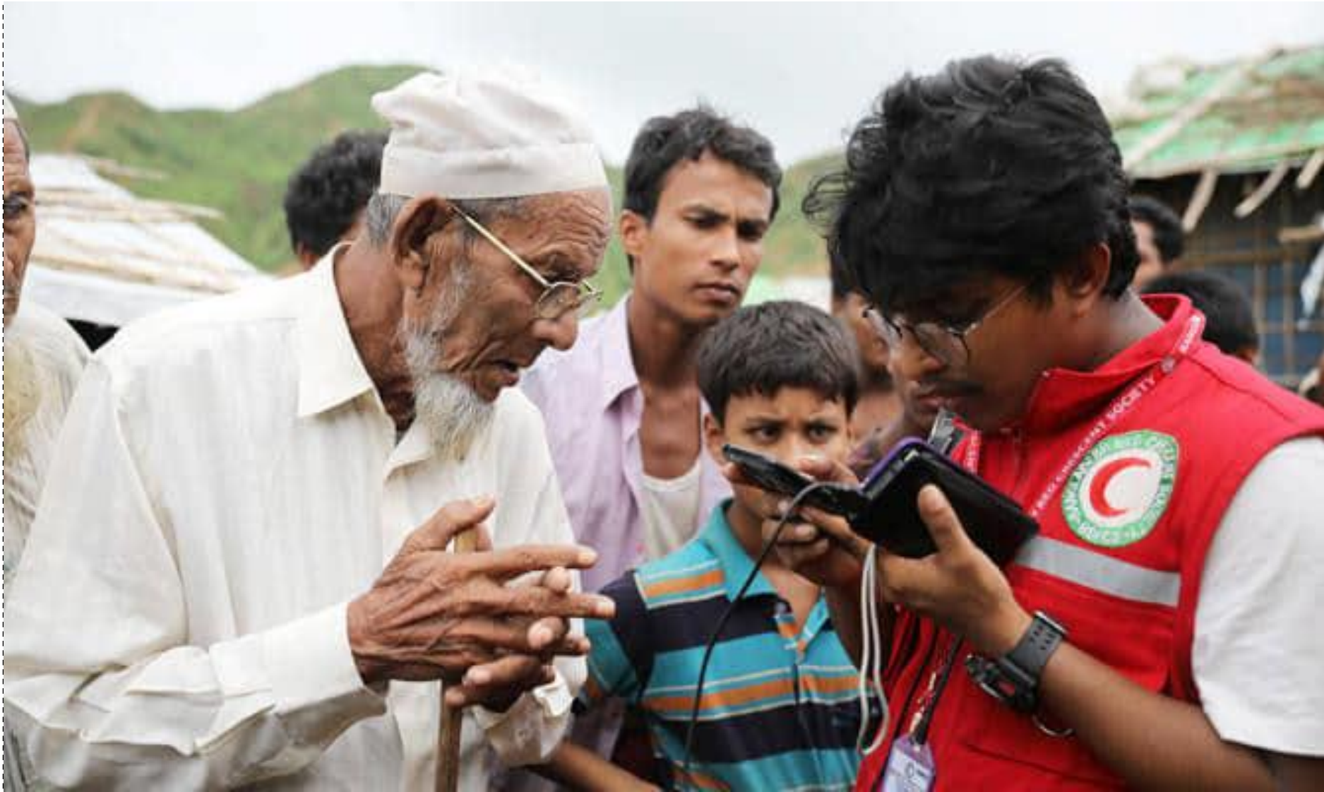
In picture, A BDRCS volunteer collecting Data to support in Restoring Family Links (RFL) service to the Displaced People from Rakhine, Myanmar in Cox's Bazar, Bangladesh.