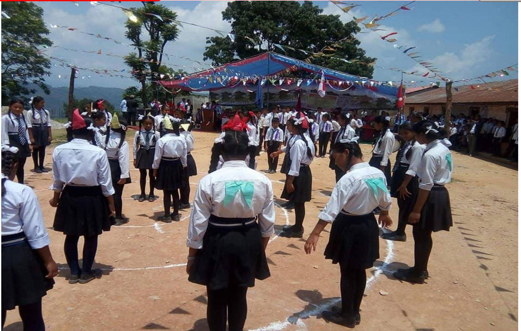
Junior/Youth members participating in district level Red Cross junior/youth's seminar organized by District Chapter Syangja 25/26 th May 2018.