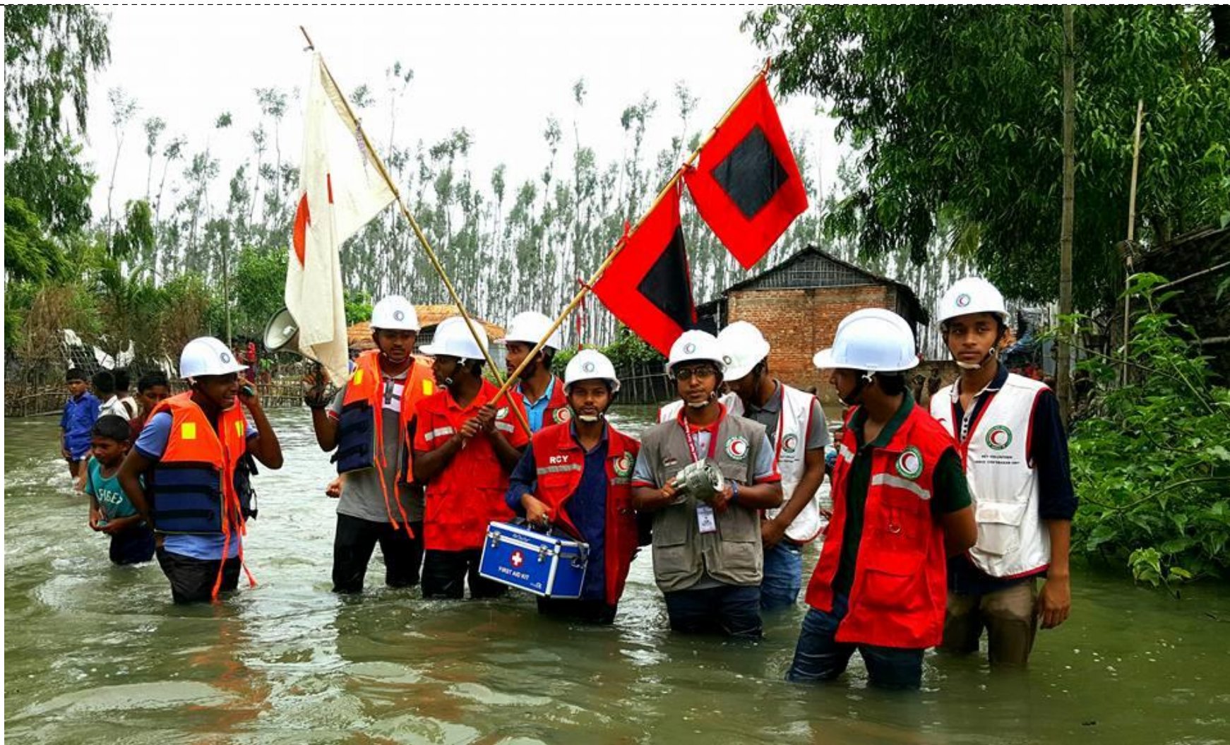
In picture BDRCS RCY volunteers disseminating early warning message during tropical Cyclone 'Mora' in 2017.