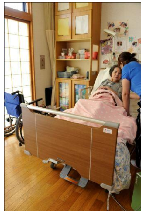
JRC is aiming at a distribution of 1,000 beds designed for the elderly who require special care at nursing care facilities in the affected prefectures.