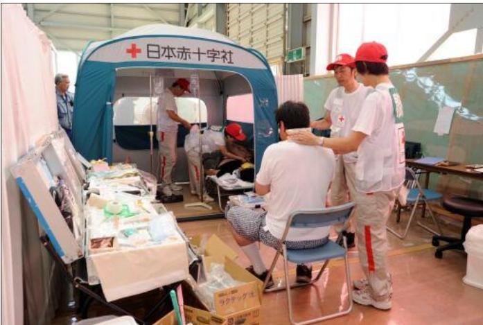
A JRCS medical team service centre in Fukushima. The evacuated residents return for a brief home visit and receive treatment for heat stroke and bruises.