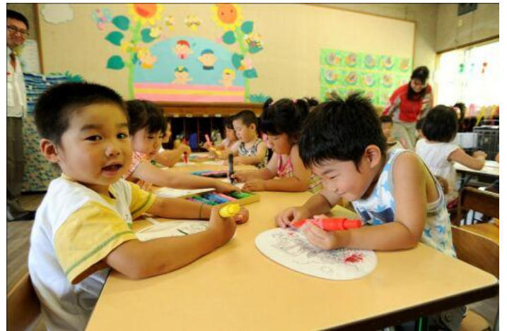
Children enjoy making paper fans led by the JRC staff during Kids Cross Project. (Yamada-cho, Iwate)