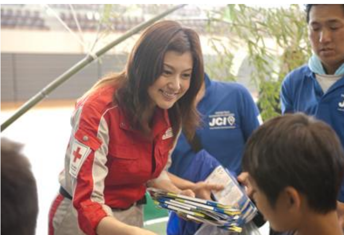
Ms. Norika Fujiwara, Goodwill Ambassador of JRCS and a well-known Japanese actress, visited Shiogama city in Miyagi on 23 July and distributed 300 sets of relief items to the evacuees.