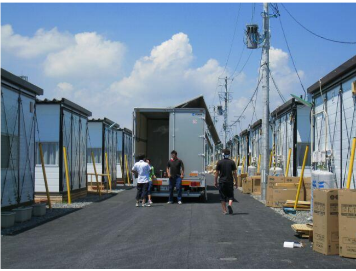
150 electronic appliances are installed under horrendous heat in one of the prefabricated housing zones in Ishinomaki. Another 150 sets were to be installed in this zone the following day. Approximately 1,000 sets are delivered across the nation on a daily basis.