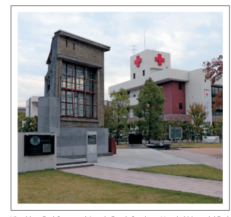
Hiroshima Red Cross and Atomic Bomb Survivors Hospital Memorial Park