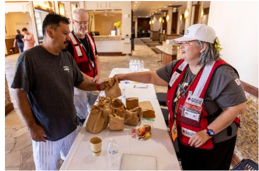
Volunteers serving meals and snacks at a hotel lobby

For more details, please visit the "USA - Hawaii Wildfires Relief Programme" page :