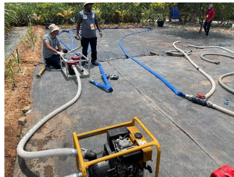
During the training, trainees install and operate the water purification system

A small-scale water and sanitation disaster response kit includes water tanks, water purification unit and agents, water quality testing kits, materials for installing rapid latrines, hygiene education materials, etc., and has been prepositioned at the NSs in this region to enable adequate water supply and sanitation activities when a disaster happens. The preposition of the equipment is accompanied by a series of training courses for local staff and volunteers on how to operate and maintain the kit, as well as how to do water quality testing and hygiene promotion.