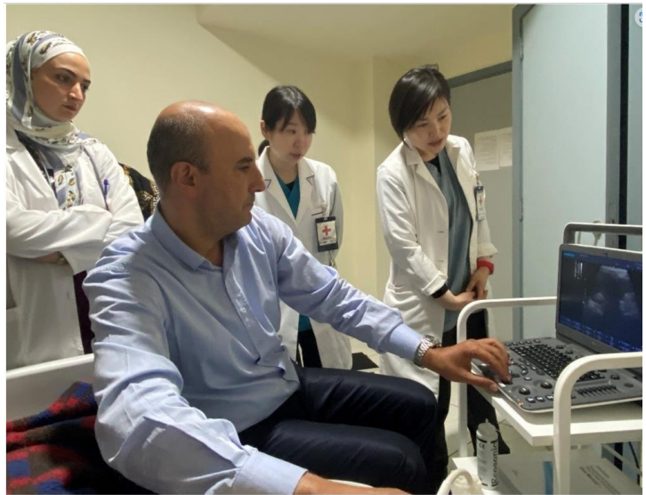
JRCS doctors watch as a local urologist gives ultrasound guidance to a trainee doctor.