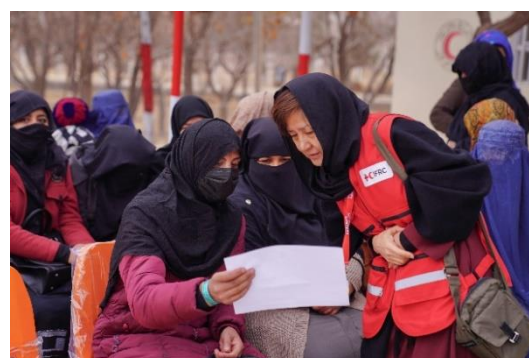
The JRCS health delegate talks with a woman supported by the ARCS

For more details, please visit the “Afghanistan Herat Earthquake Relief” page: