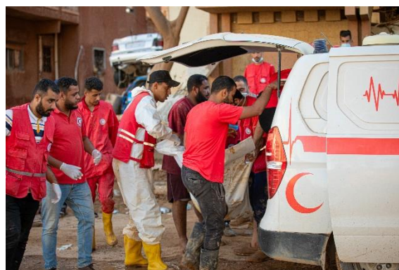
Transporting injured person by ambulance service

For more details, please visit the "Libya Flood Relief Programme" page: https://www.jrc.or.jp/international/results/Libya2023.html