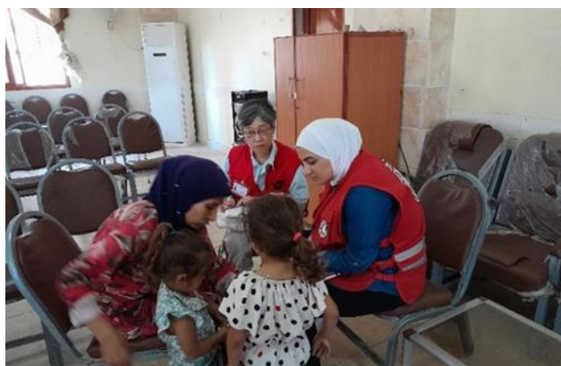
A JRCS nurse as health coordinator listens to the voices of victims

The JRCS has also contributed in longer-term activities such as a newly launched disaster preparedness and risk reduction programme to increase resilience and to build a capacity for early recovery for future disasters in the countries in the Middle East.