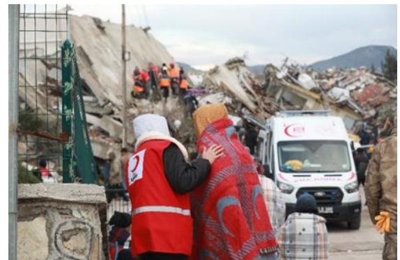
Turkish Red Crescent staff standing by a victim

In the early hours of February 6, 2023, a magnitude 7.8 earthquake occurred near the Syrian border in southeastern Turkey. It was an unprecedented large-scale disaster in the region which took nearly 60,000 lives and affected 17 million people in both Turkey and Syria. In addition to a series of aftershocks and massive destruction over a vast area, the harsh winter conditions posed a huge challenge on emergency life-saving activities. The social infrastructure in the affected areas on the Syrian side was already in a weak state due to the 12 years of conflict. Amidst all these difficulties, both the Turkish Red Crescent Society (TRCS) and the Syrian Arab Red Crescent (SARC) began strenuous relief efforts immediately after the disaster.