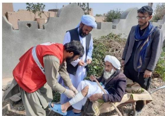
Mobile health unit team treating an injured man ©ARCS