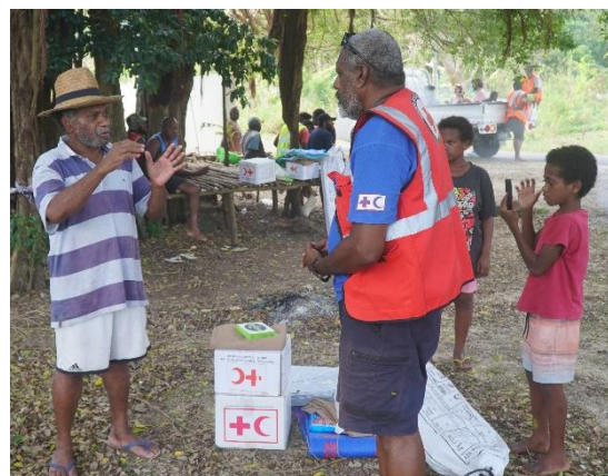
Distributing shelter tool kits and hygiene kits to residents affected by the cyclone in Vanuatu