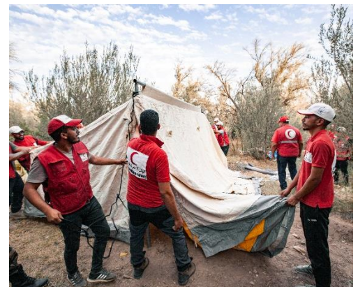
MRC staffs setting up tents