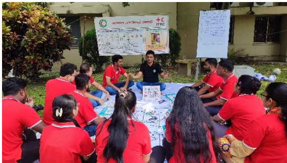
Participants trained in proper hygiene management in case of disaster. (Bangladesh)

Through mainly its financial support, the JRCS has been working with the IFRC for many years to strengthen emergency WASH efforts in this region.