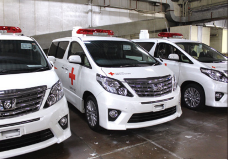
Disaster response vehicles are now ambulance type.

Our relief experiences with this disaster were more of a struggle than we had expected. Therefore, we are applying what we have learned to improve the level of our disaster preparedness in future.