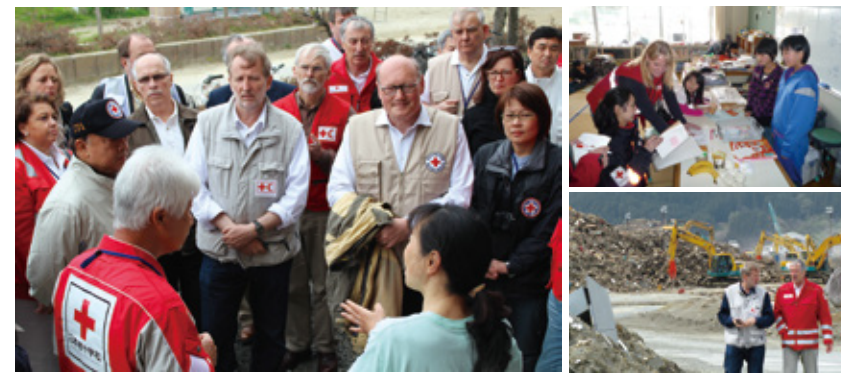
May 2011, Red Cross personnel listening to a public health nurse giving a talk at an elementary school (Ishinomaki city, Miyagi prefecture)