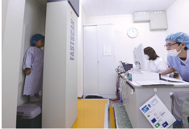
Eight whole body counters and thyroid test monitors were donated to hospitals. These are being used to test people for internal exposure.

"I want my normal life back." was an often heard comment. However, the accident at the Fukushima Daiichi Nuclear Power Plant had drastically changed the lives of people in the surrounding area. In order to reduce anxiety about health, JRCS supplied equipment for measuring exposure to radiation.