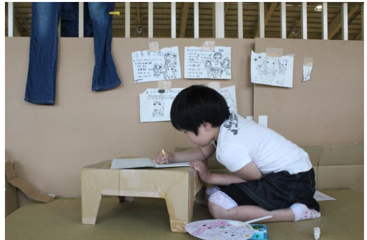
A third-grade girl who lives in an evacuation centre with her mother in Rikuzentakata studies on a desk made of cardboard at a "study space" within the evacuation center.