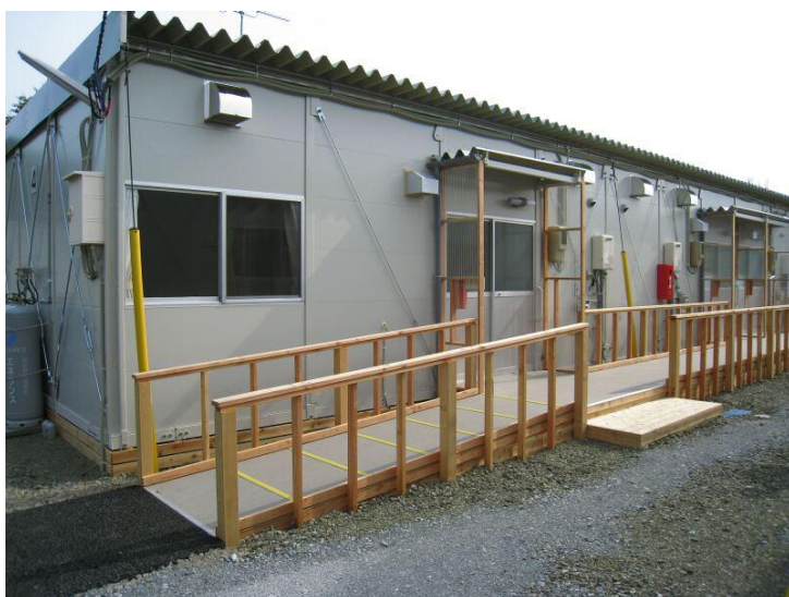
Prefabricated housing in Shichigahama-machi in Miyagi, installed with the electronic appliances package by the Japanese Red Cross.