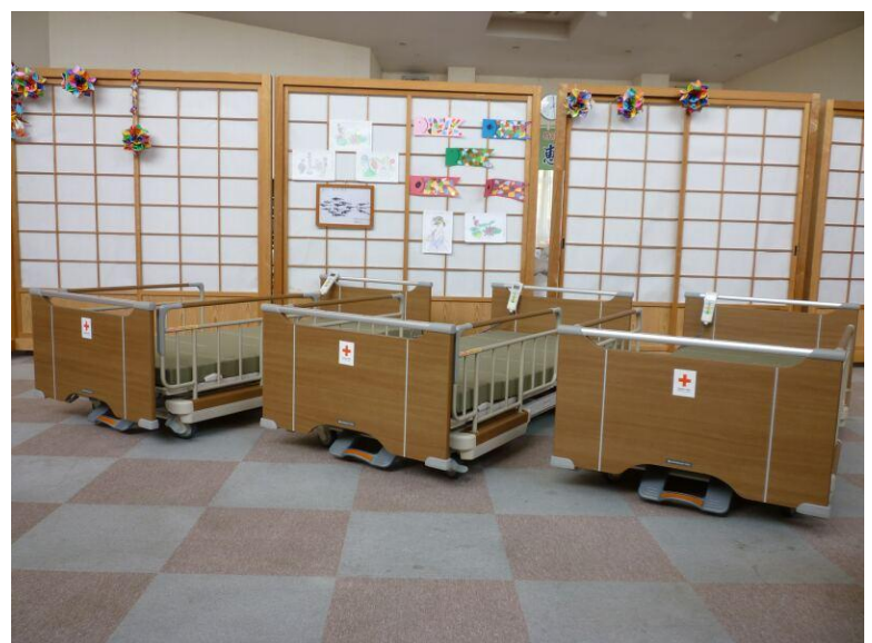
The distribution of medical/nursing beds have started in 60 facilities in Miyagi Prefecture.