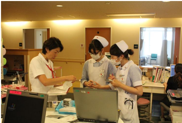
Students at the Red Cross Nursing School in Ishinomaki on training at the Ishinomaki Red Cross Hospital. The nursing school was destroyed by the tsunami and the classes are currently held at a university campus close by.