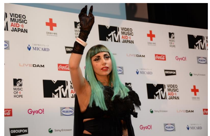
Lady Gaga during the press conference (23 June) prior to "MTV Video Music Aid Japan". Lady Gaga expressed her support for the survivors of the March 11 earthquake and tsunami and urged foreign tourists to return to Japan.