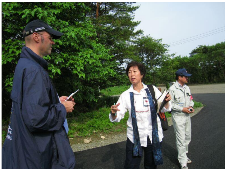
JRCS staff explains the status of the prefab housing to the Asian representative of ECHO during a field trip to hichigahama-machi in Miyagi prefecture.