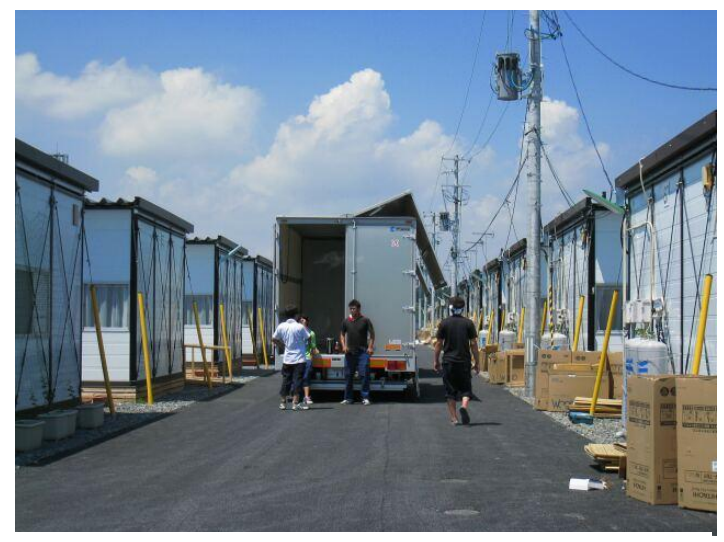
150 electronic appliances are installed under horrendous heat in one of the prefabricated housing zones in Ishinomaki. Another 150 sets were to be installed in this zone the following day. Approximately 1,000 sets are delivered across the nation on a daily basis.