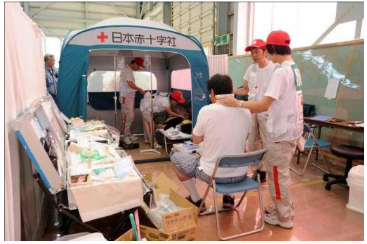
A JRCS medical team service centre in Fukushima. The evacuated residents return for a brief home visit and receive treatment for heat stroke and bruises.