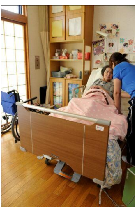
JRC is aiming at a distribution of 1,000 beds designed for the elderly who require special care at nursing care facilities in the affected prefectures.